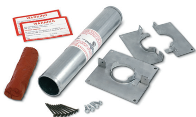
Firestop kits with 1" (25mm), 2" (51mm) or 4" (102mm) diameter by 12" (304mm) length putty sleeves

1. Product Description 3M™ Fire Barrier Putty Sleeve Kits DT 100, DT 200 and DT 400 are designed to help prevent the passage of fire and smoke in new or existing cable penetrations through walls or floors. Each kit comes complete in a box containing a 3M™ Fire Barrier Putty Sleeve (two-part metallic sleeve with set of two-part metallic flanges), 3M™ Fire Barrier Moldable Putty+, sheet metal screws, drywall screws and two installation identification labels. These kits can be used as a one-piece sleeve or the sleeve may be split/hinged for existing cable installations. The sleeves can be easily installed in openings that are either tight to the sleeve or irregular. The oversized openings can accommodate up to a one-inch larger diameter than the 3M™ Fire Barrier Putty Sleeve diameter.